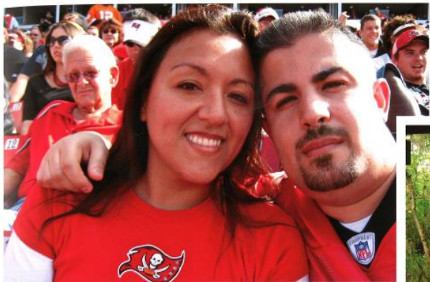
Having fun at a Bucs game