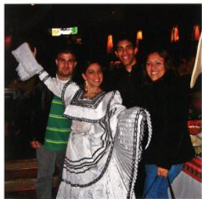
Enjoying some Peruvian culture in Lima, Peru