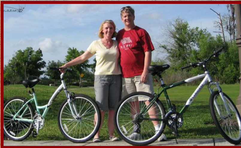
Exploring the trails.