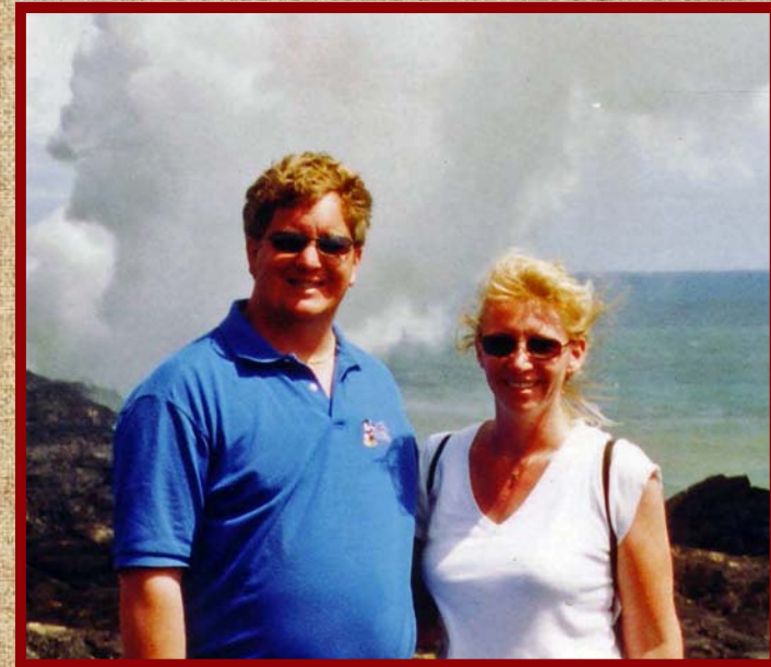
Hiking the lava fields in Hawaii.

We have a passion for traveling and have visited some wonderful places around the world. We have continued our travels, even after the blessing of our daughter, as we feel it is important that children be exposed to the world that surrounds them. Before children, our first vacation together was at Disney World. It only took one visit and we were bitten by the "Disney bug!" We enjoyed the Disney experience so much that we are now members of the Disney Vacation Club which allows us to enjoy the Disney experience for the next 48 years with our children and grandchildren!