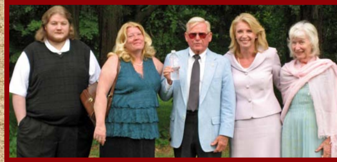
Hamming it up with family at a nephew's wedding.

I've been in the Human Resources field for just about fifteen years and it now offers me a high level of flexibility as well as the opportunity to work from home part of the week. The flexibility gives me special time to spend with my daughter, I also get to do things that I enjoy like gardening, running, yoga, cycling, flying, and backyard astronomy. I have hobbies I work on such as sewing, crocheting, embroidery, and working on puzzles. I've always been a science buff and have recently become interested in history and genealogy.