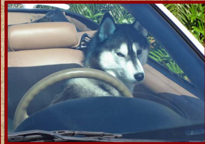
It's a "ruff" life!