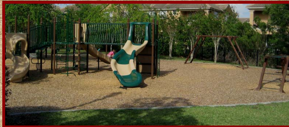
A playground for kids of all ages!

Our community is close to an excellent elementary and middle school. We look forward to riding bikes or walking our children to school on nice days. We researched the schools by talking with parents whose children attend there and teachers who work there. We are very impressed with their approach to education and the importance they place on each child as an individual.