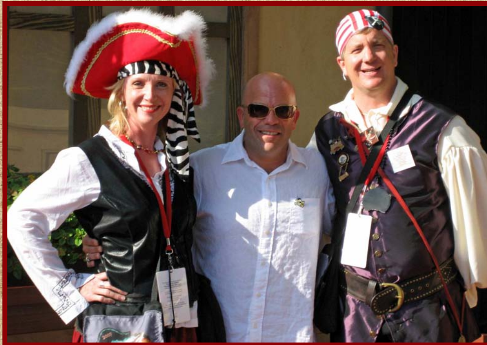
Playing pirate with Pintel.